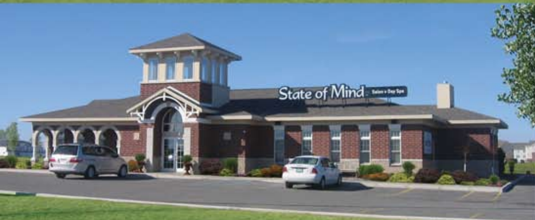
Day Spa Building