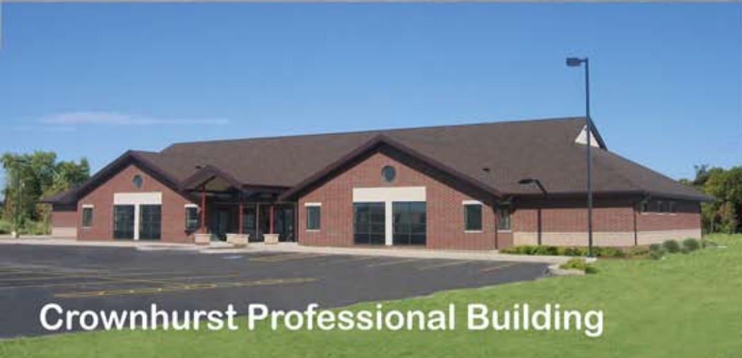
Crownhurst Professional Building