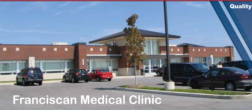
Franciscan Medical Clinic

* Location is an already established and growing commercial development area.