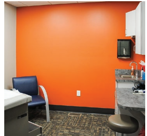
Interior work involved complete redesign and redecorating. The emphasis was on functionality, made attractive and welcoming by warm colors and comfortable spaces.