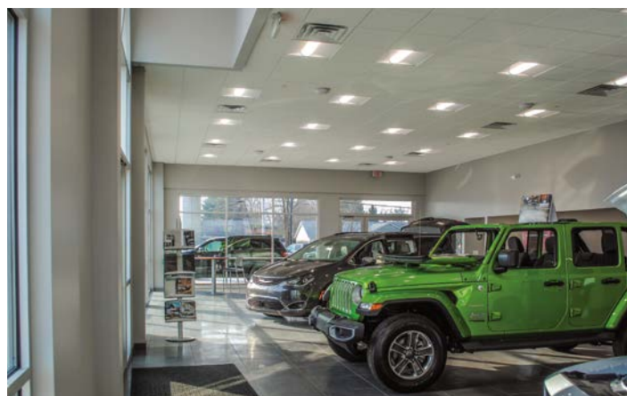
The modern showroom features abundant natural light.