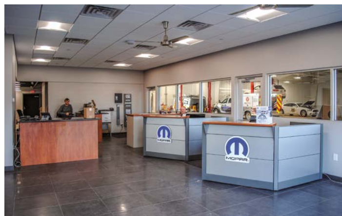
Staff members are prepared to help clients in the new parts and service department.