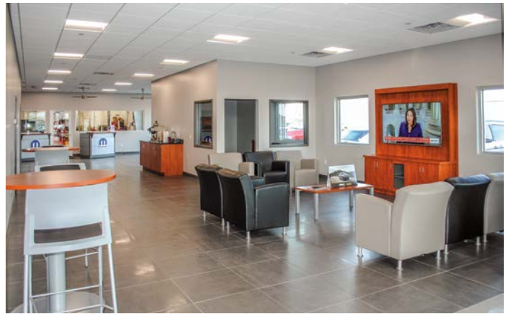
A cozy waiting area greets customers when they arrive at the dealership.