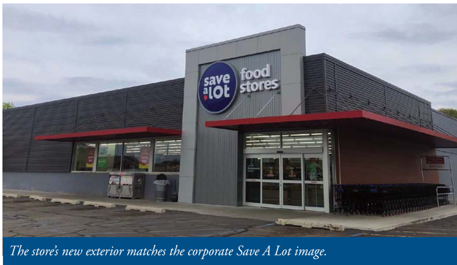
The store's new exterior matches the corporate Save A Lot image.