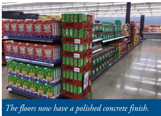
The floors now have a polished concrete finish.