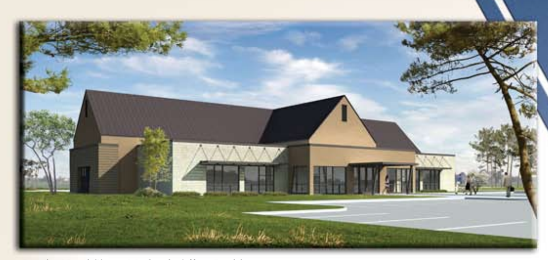
Lot 1 - NorthShore Medical Office Building